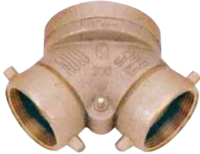
Straight type model LF-FDCG