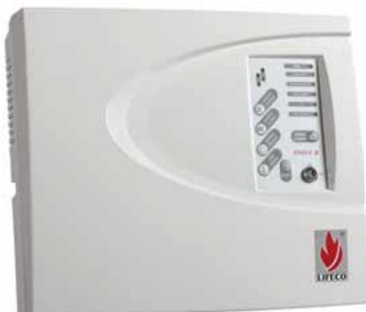
2 Zone Fire Alarm Control Panel – Eagle 2

The Eagle 1 conventional fire alarm panel provides 1 fixed zones. With up to 32 fire detectors and unlimited call points that can be connected to every fire zones. The Eagle 1 is situated in a plastic box. The panel is easy for installation and maintenance and provides user-friendly daily operations. The panel is suitable for residential, small and middle office applications with protected area up to 1000m2. The panel is available in different language versions for the front panel.