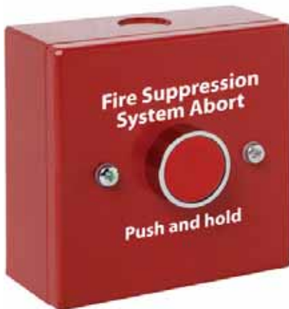
Abort Switch - LF1823-10

The LIFECO Ancillary Board is compatible with all LIFECO HAWK Releasing control panels. The board provides volt free normally open contacts allowing control of sub-systems and plant remotely from the main panel over a two wire data bus. Ancillary boards require only a two core data cable from the main control panel and a two core power cable from the main panel.