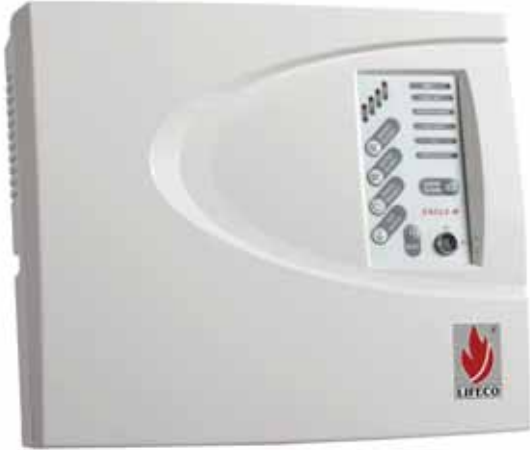
4 Zone Fire Alarm Control Panel – Eagle 4