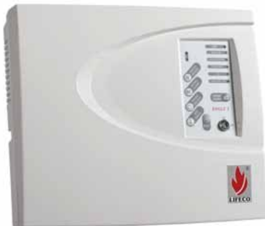
1 Zone Fire Alarm Control Panel – Eagle 1