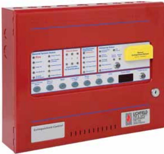
Clean Agent Releasing Control Panel - LF1810-12 | LF1810-13