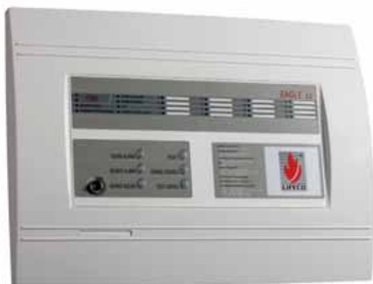
12 Zone Fire Alarm Control Panel – Eagle 12

The Eagle 8 conventional fire alarm panel provides 8 fixed zones. With up to 32 fire detectors and unlimited call points that can be connected to every fire zones. The Eagle 8 is situated in a plastic box. The panel is easy for installation and maintenance and provides user-friendly daily operations. The panel is suitable for residential, small and middle office applications with protected area up to 3000m2. The panel is available in different language versions for the front panel.