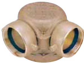
90° type model LF-FDCI