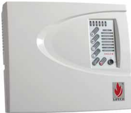
6 Zone Fire Alarm Control Panel – Eagle 6

The Eagle 4 conventional fire alarm panel provides 4 fixed zones. With up to 32 fire detectors and unlimited call points that can be connected to every fire zones. The Eagle 4 is situated in a plastic box. The panel is easy for installation and maintenance and provides user-friendly daily operations. The panel is suitable for residential, small and middle office applications with protected area up to 2200m 2 . The panel is available in different language versions for the front panel.