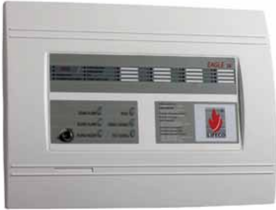
16 Zone Fire Alarm Control Panel – Eagle 16