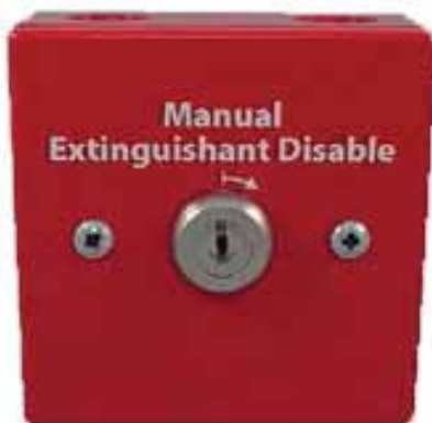
Manual Disablement Switch - LF1832-10

The LIFECO Abort switch connects to the Abort terminals of the LIFECO Hawk releasing panel. Any number of Elite Abort switches may be connected to the circuit. The last switch must have the end of line device from the Abort circuit terminals of the LIFECO Hawk releasing panel fitted across its connections to provide open and short circuit supervision.