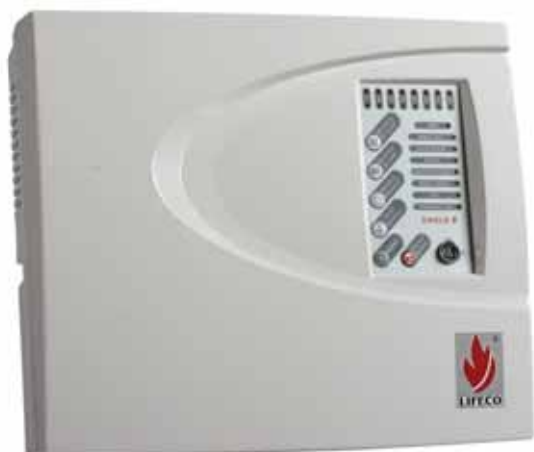
8 Zone Fire Alarm Control Panel – Eagle 8